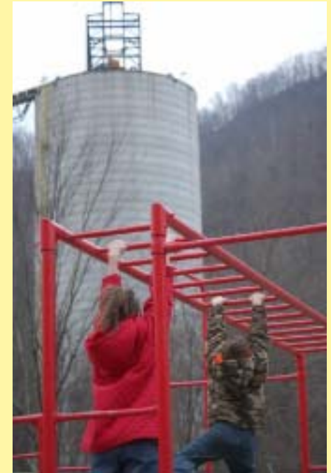
Marsh Fork Elementary School students play in the shadow of a Coal Silo.